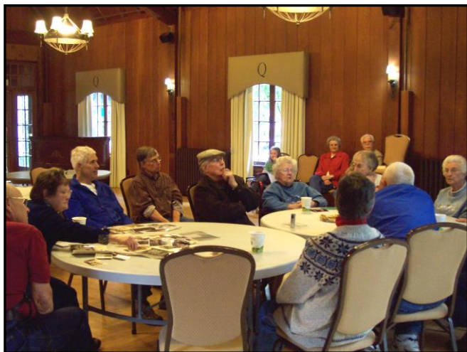
The Gang's all here...