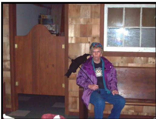
Taking a well deserved break...