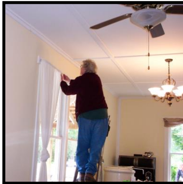
Hanging curtains on opening day.