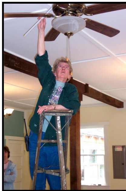
Reaching high places....