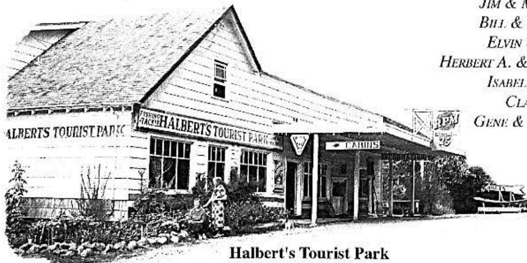
Halbert's Tourist Park (Rain Forest Resort)