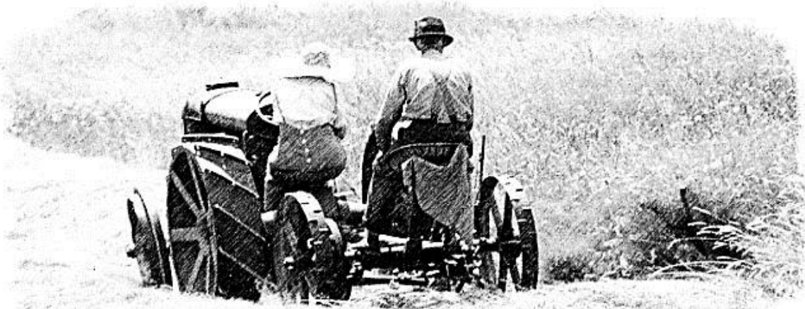
Cutting Grass in the Quinault Valley 1930's

Lake Quinault Museum, P.O. Box 35, Quinault, Washington 98575